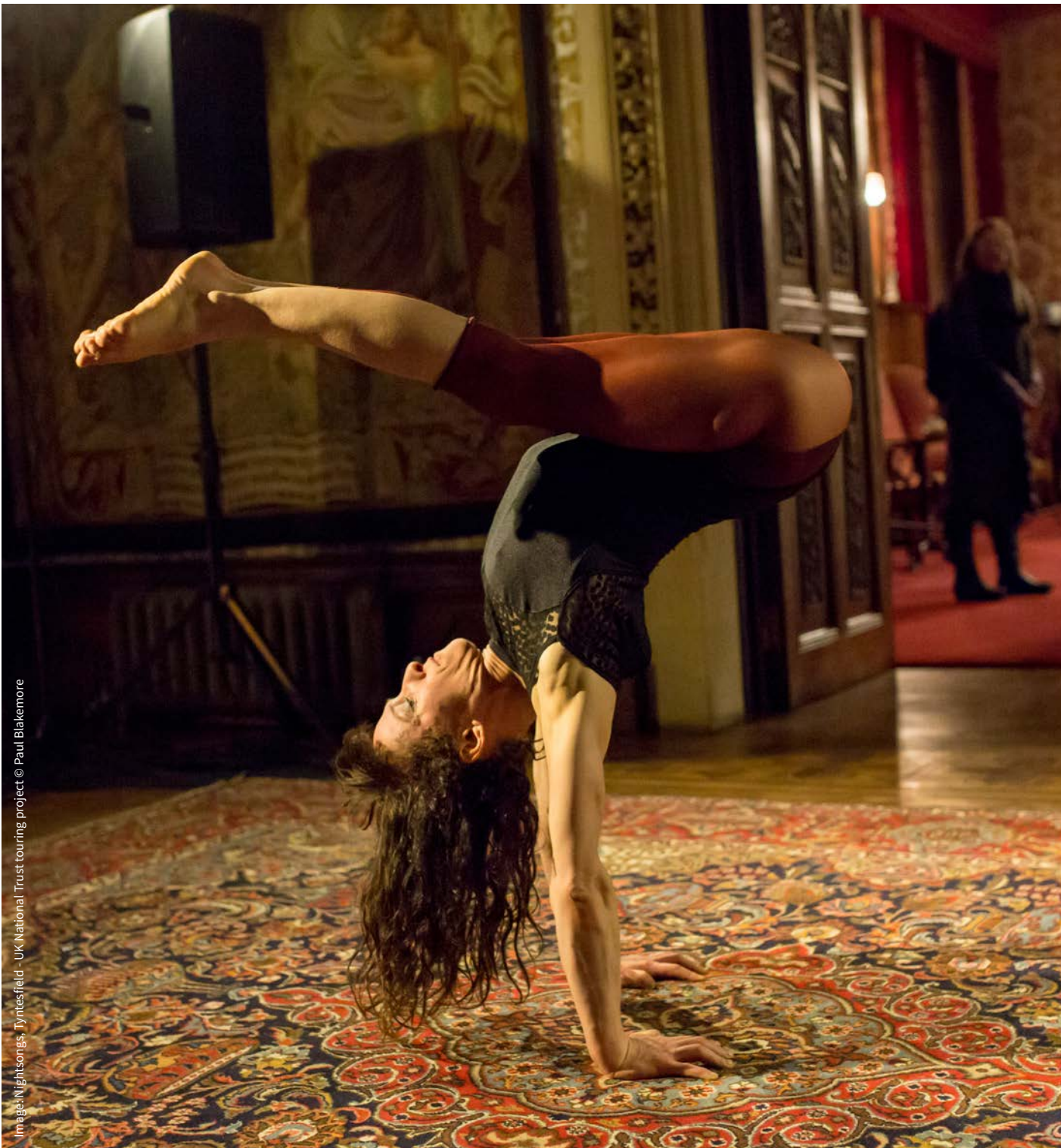
Image: Wightsongs, Tynesfield - UK National Trust touring project